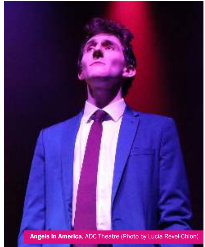
Angels in America, ADC Theatre