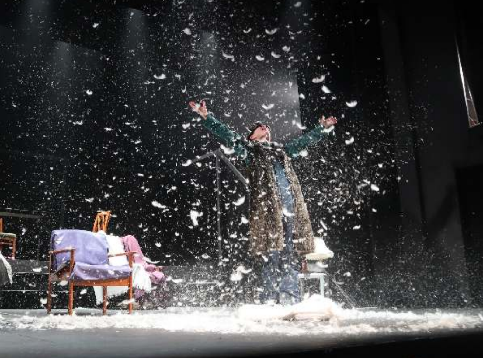
Angels in America, ADC Theatre