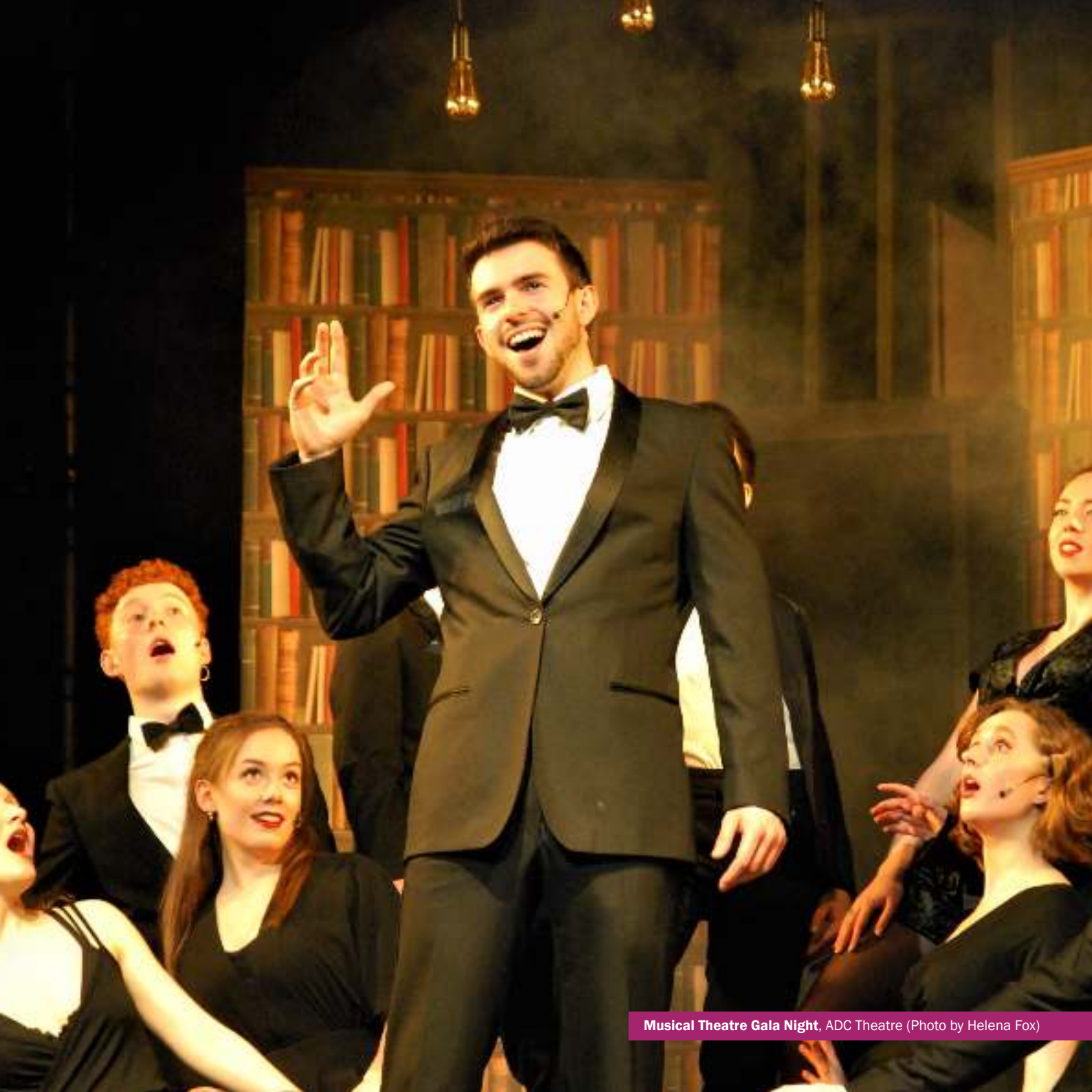
Musical Theatre Gala Night, ADC Theatre