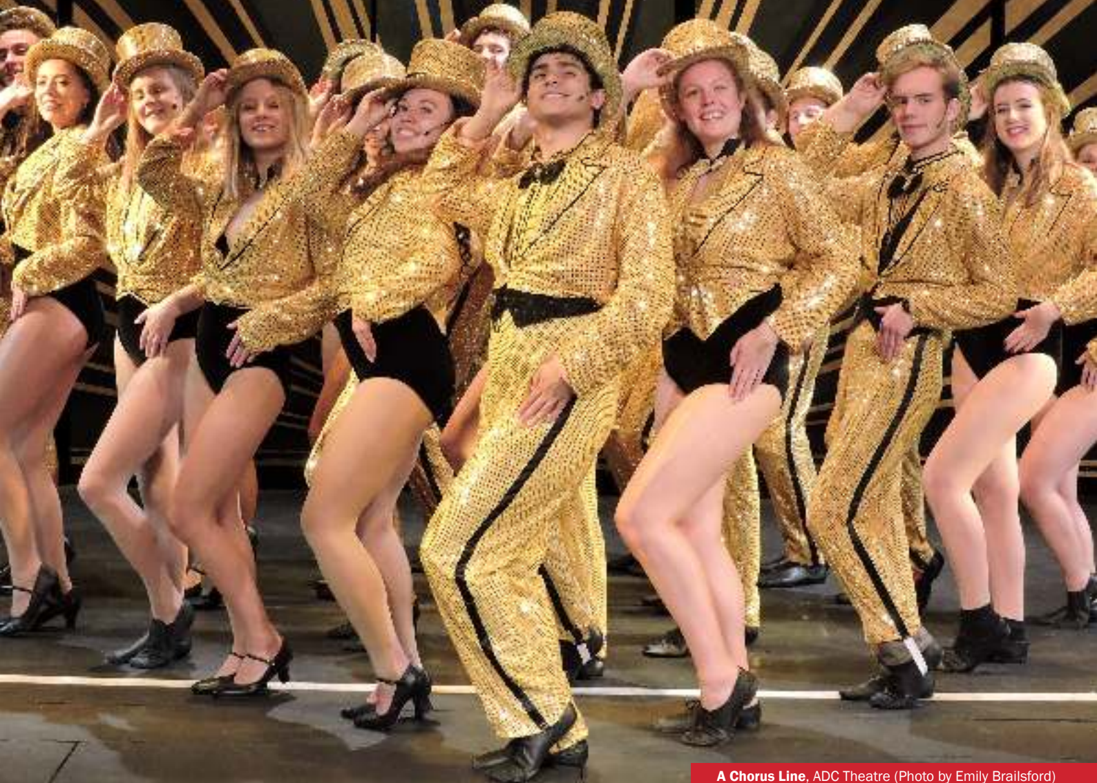
A Chorus Line, ADC Theatre