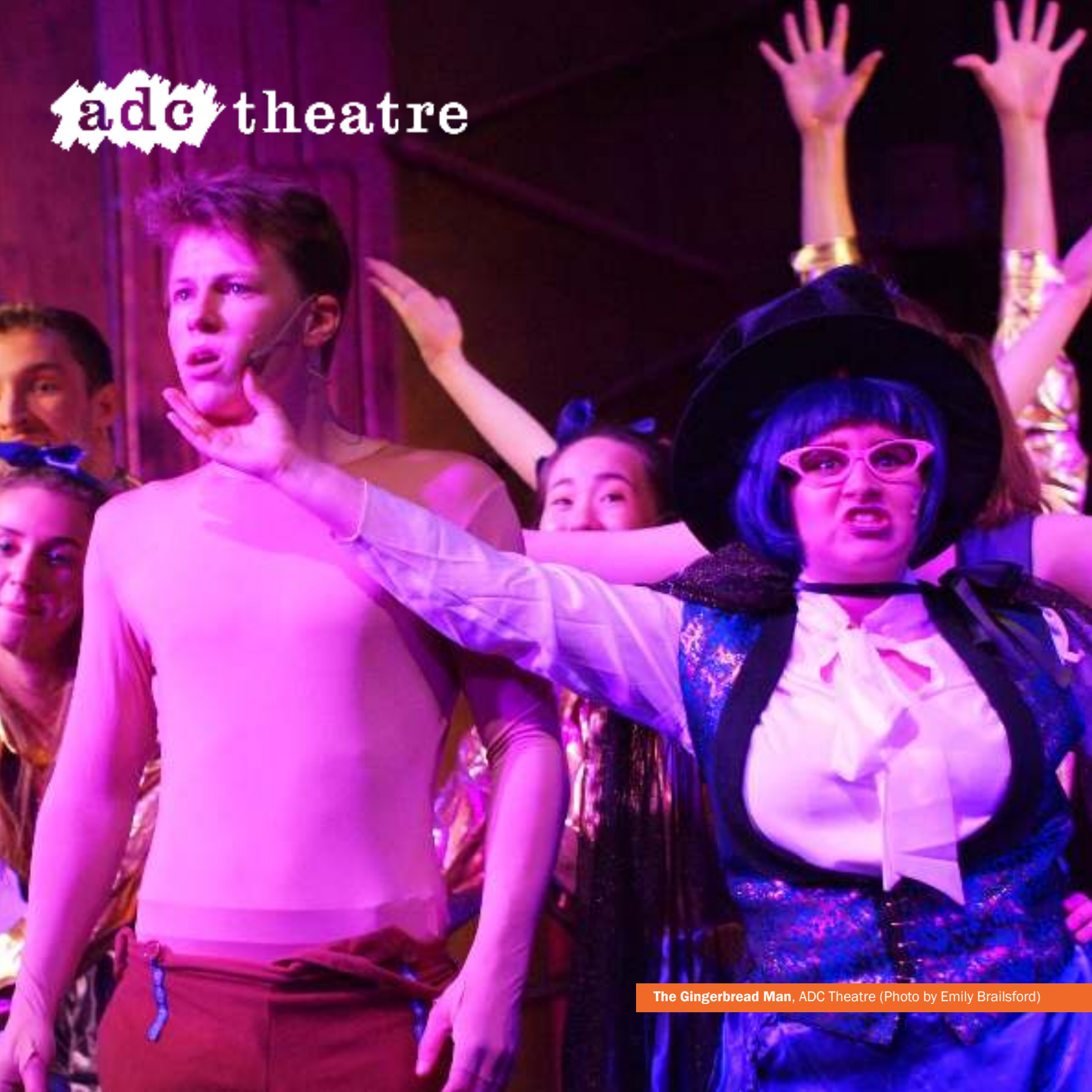
The Gingerbread Man, ADC Theatre